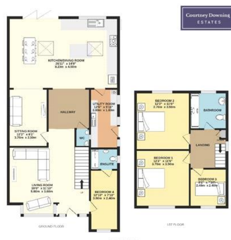
FOR SUBMICE DALS